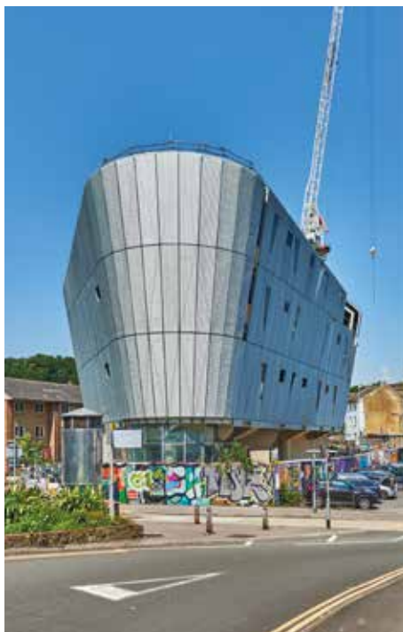
F51 The world's first multi-storey skatepark